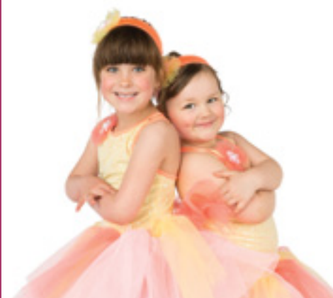
All dates subject to change.

Auditions February 24th, 2019 Performances April 25th-May 12th